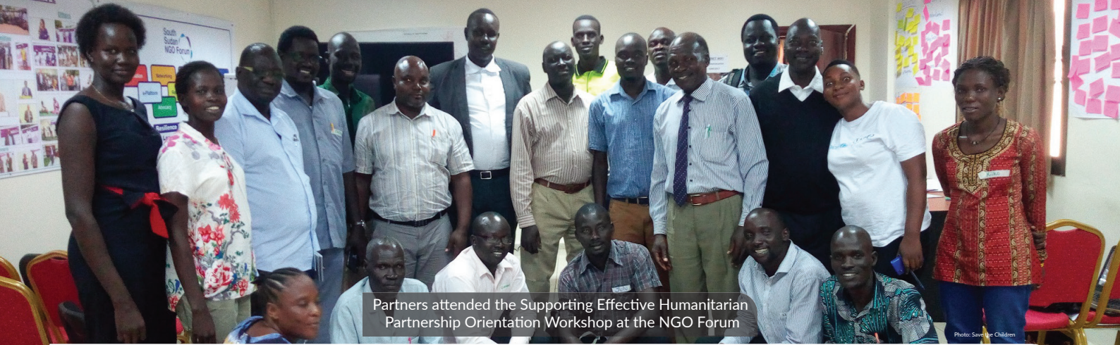
Partners attended the Supporting Effective Humanitarian Partnership Orientation Workshop at the NGO Forum